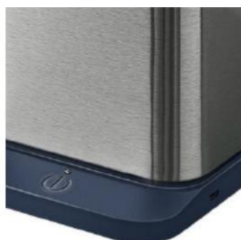
Touch-on Button Press button to sterilize cyclically easily

Model:BS2022 Outer barrel material: 304 stainless steel Inner barrel material:PP Functional: disinfect,Storage rack Usage Space:Kitchen Size:110*130*245mm